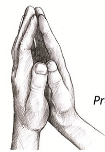
Praying hands flag